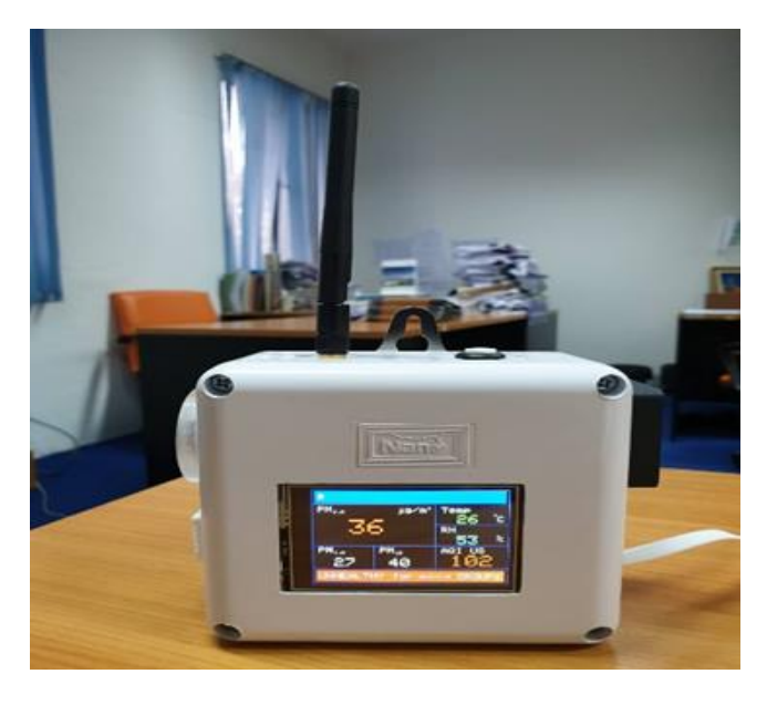
Figure 1 Low-Cost Particulate Matter Measuring Device

A Low-Cost Particulate Matter Measuring Device with Smart Sensor model PMS-5003 [7] is shown in Fig. 1.