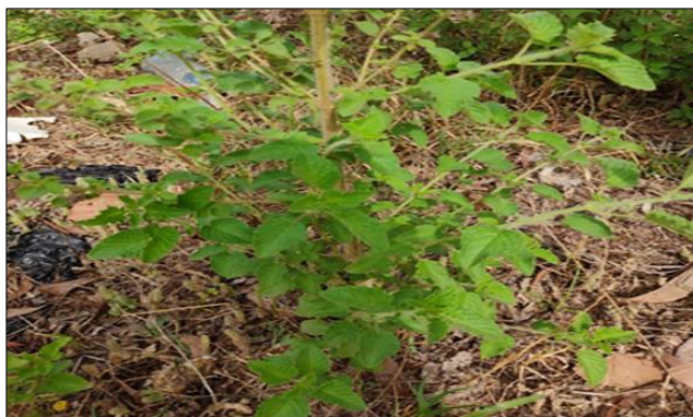
Figure 3 Tree of Hyptis suaveolens