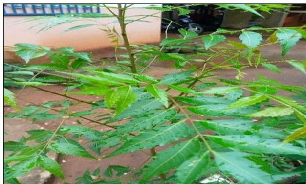
Figure 4 Tree of Azadirachta indica