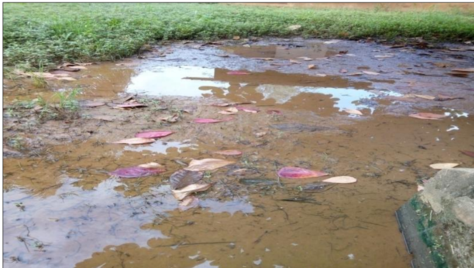
Figure 2 Breeding site of Anopheles gambiae s.l. larvae surveyed in Dogbo district

Anopheles gambiae s.l. mosquitoes were collected from April to July 2022 during the great rainy season in Dogbo district. Larvae were collected from breeding sites using the dipping method and kept in labeled bottles (Figure 2). The samples were then carried out to the Laboratory of Pluridisciplinary Researches of Technical Teaching (LaRPET) in Department of Sciences and Agricultural Techniques of Normal High School of Technical Teaching (ENSET) located in Dogbo district.