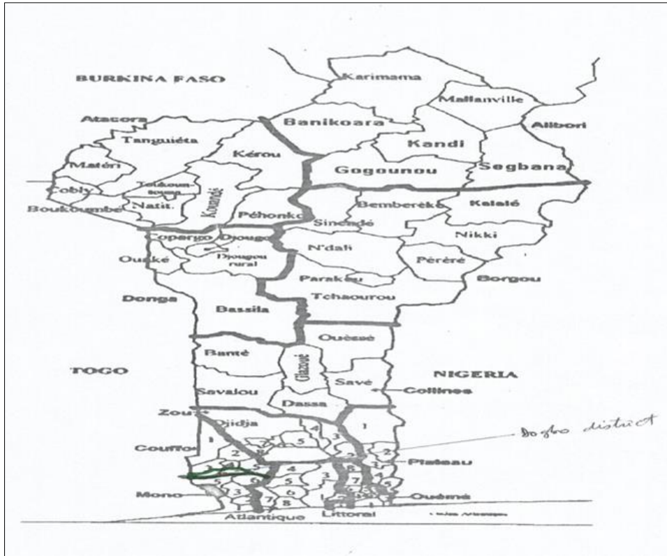
Figure 1 Map of Republic of Benin showing Dogbo District