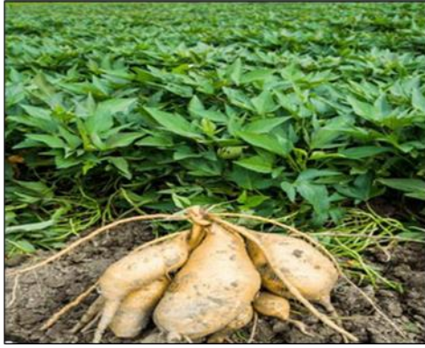
Figure 1a Sweet potato Plant