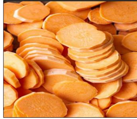
Figure 1b Sweet Potato Slice